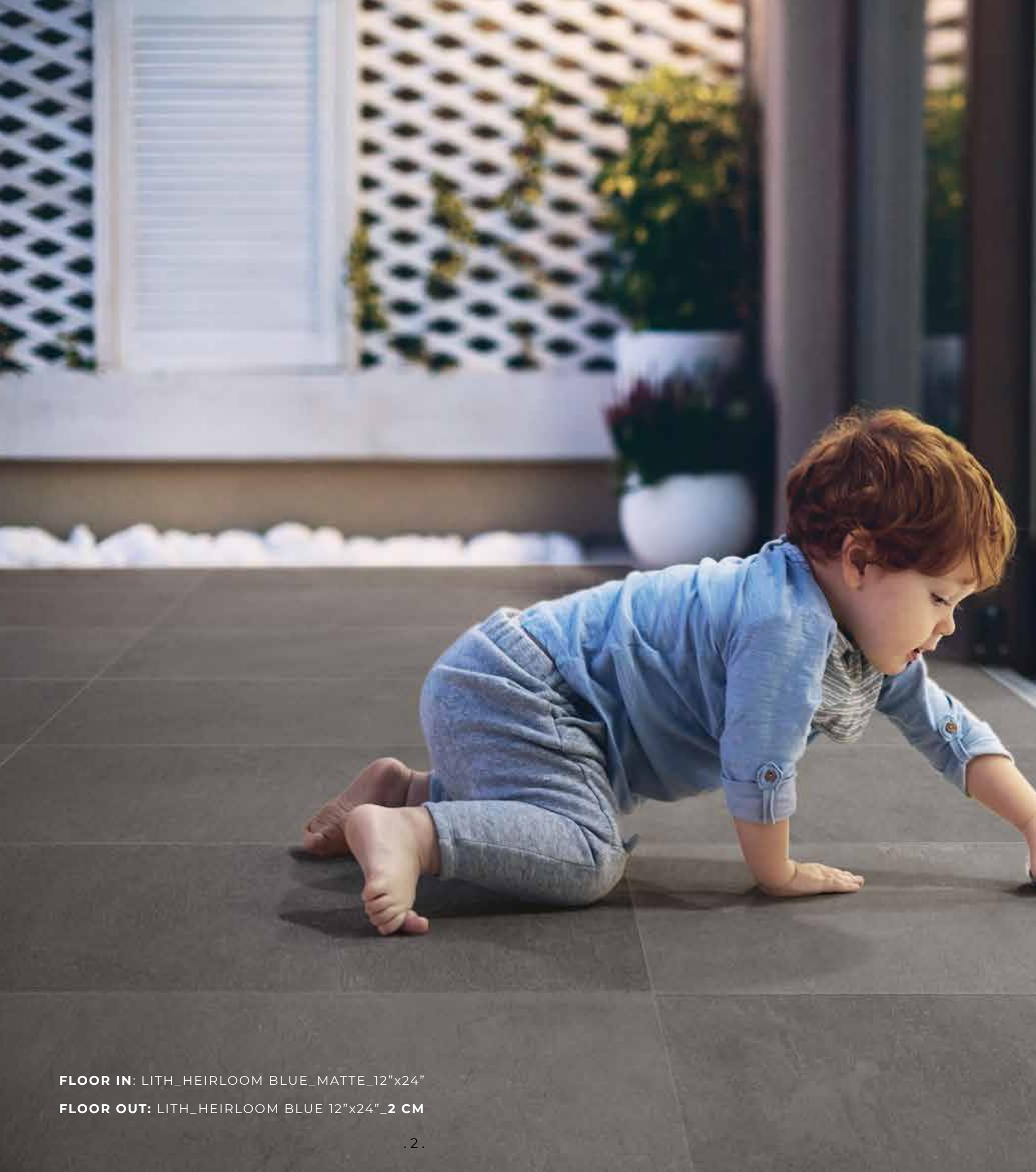
FLOOR IN: LITH_HEIRLOOM BLUE_MATTE_12"x24" FLOOR OUT: LITH_HEIRLOOM BLUE 12"x24" _2 CM