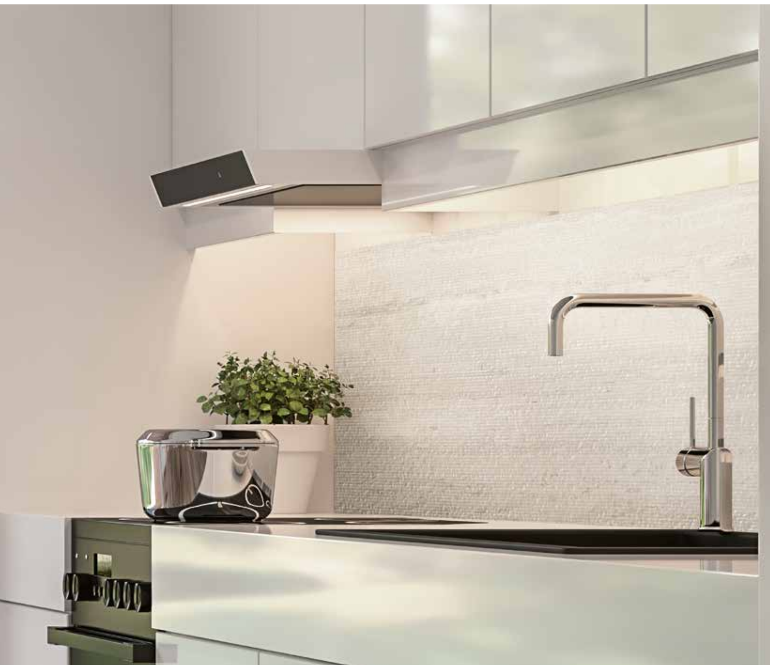
WALL IN: LITH_LEGACY WHITE_CHISELED_24"x48"