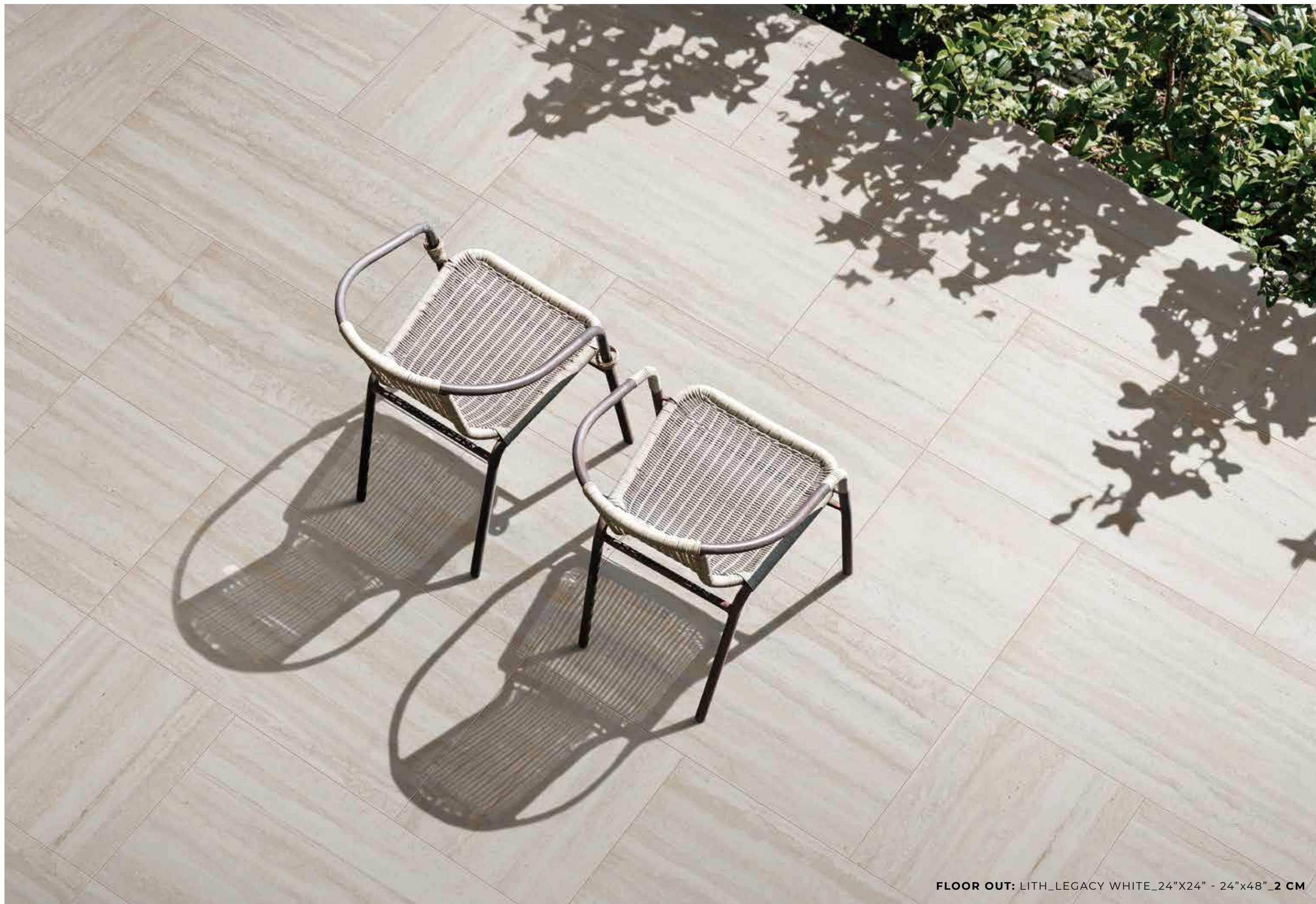
FLOOR OUT: LITH_LEGACY WHITE_24"x24" - 24"x48" _2 CM