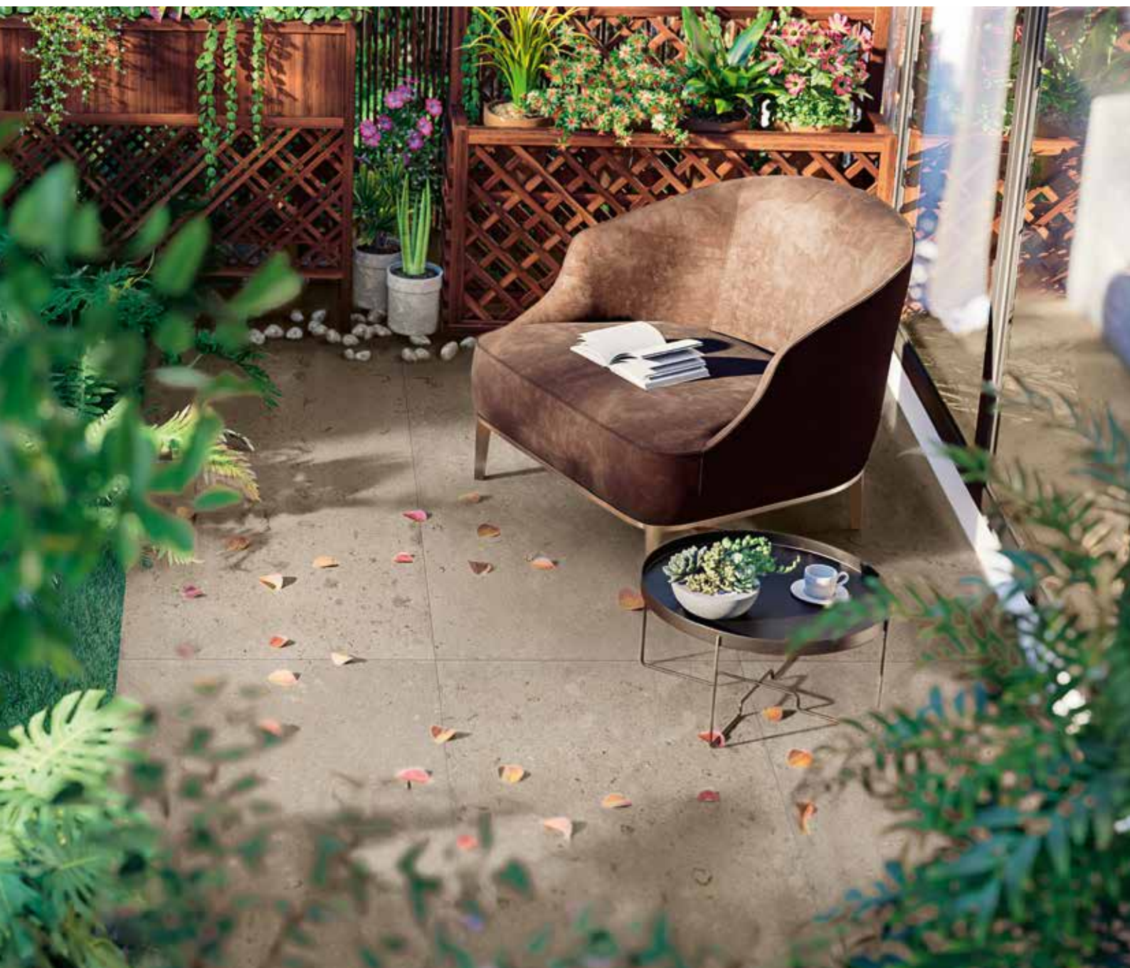
FLOOR OUT: LITH_ANTIQUÉ CREAM_24"x48"_2 CM