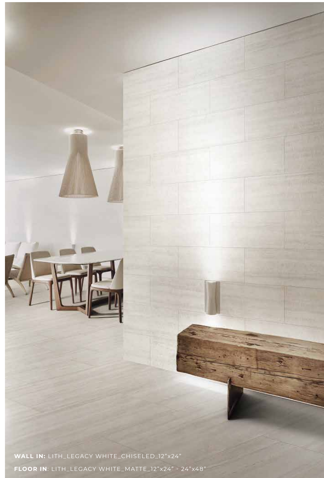
WALL IN: LITH_LEGACY WHITE_CHISELED_12"x24"