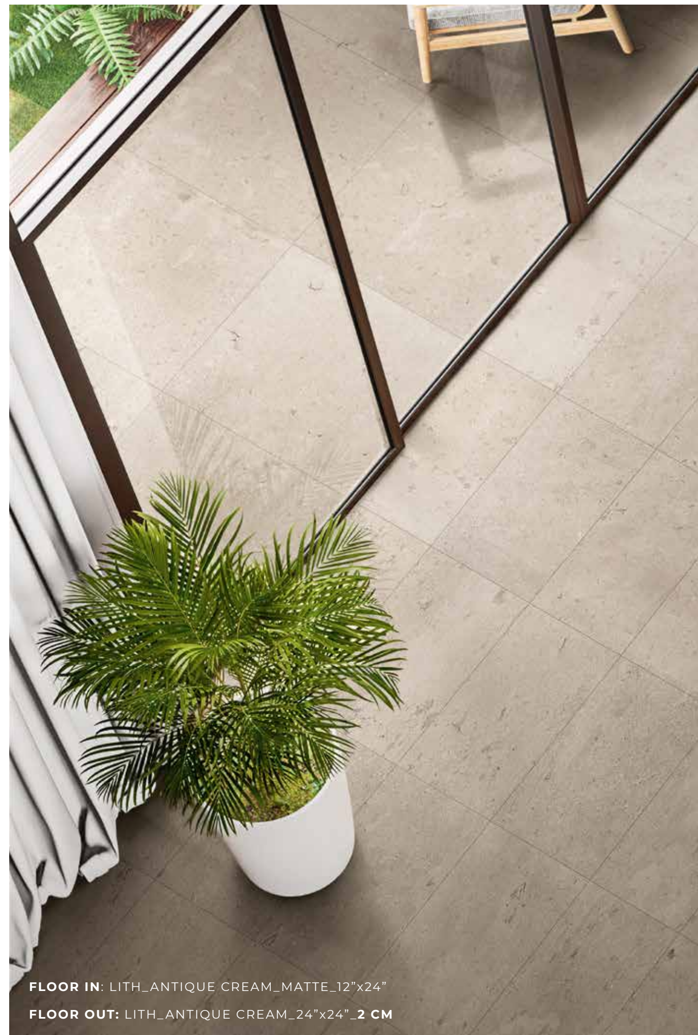
FLOOR IN: LITH_ANTIQUÉ CREAM_MATTE_12"x24"