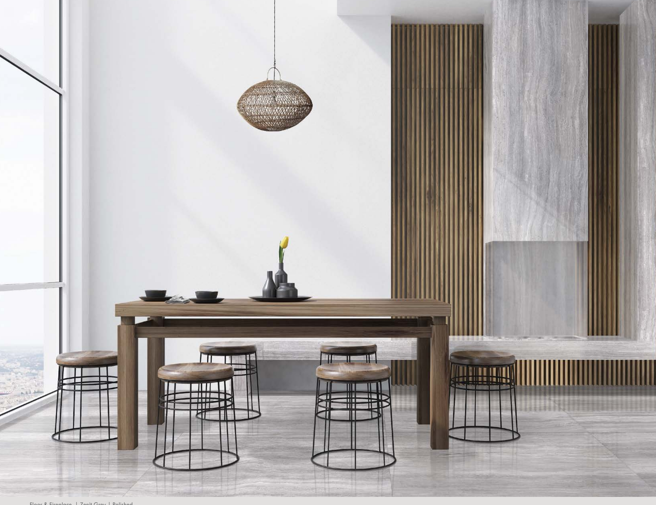
Floor & Fireplace | Zenit Grey | Polished